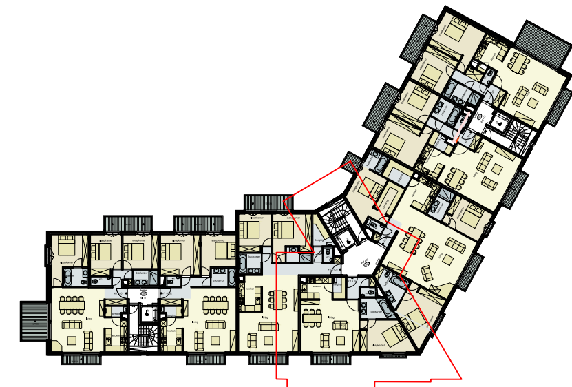
Positie in bouwblok, schaal 1/500