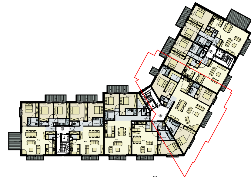
Positie in bouwblok, schaal 1/500