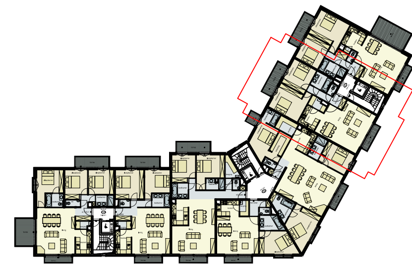
Positie in bouwblok, schaal 1/500